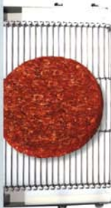
Usable mold plate area 6" (152mm) wide by 6" (152mm) front to back